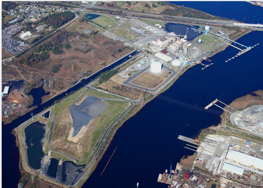
Chesapeake Energy Center, Chesapeake, Virginia

MAP has also worked on a variety of Energy based projects, including Energy Centers, Power Stations, and Oil Transportation projects. One of our recent Energy projects was for the Chesapeake Energy Center in Chesapeake, Virginia. Since 2010, MAP has provided environmental services to Dominion Virginia Power for on-going improvement to its Chesapeake Energy Center (CEC). Most recently, MAP secured the Army Corps of Engineers (COE) approval on wetland studies and required permitting for shoreline stabilization activities along the Southern Branch of the Elizabeth River. Currently, MAP is Dominion's permit manager for the decommissioning of the CEC.