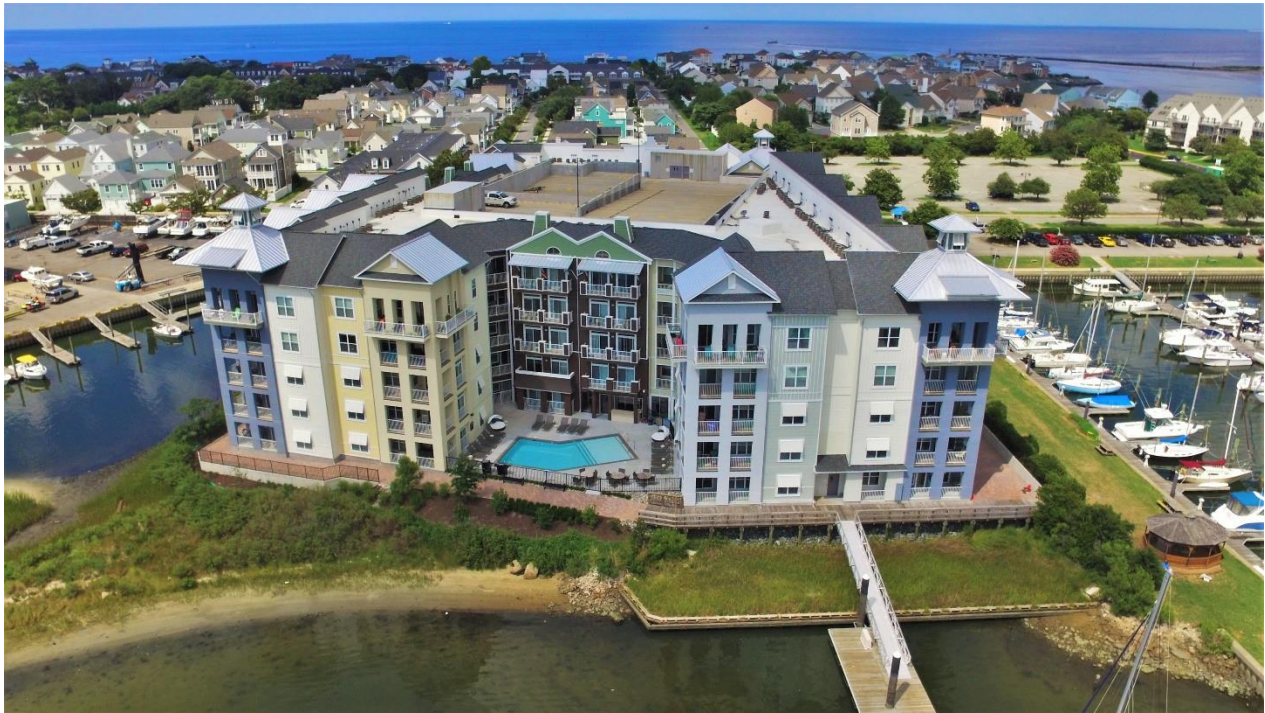
East Beach Marina and Apartments Mitigation, Norfolk, Virginia

MAP has shepherded several mitigation projects over the last three decades. From concept to completion, MAP has led mitigation as principal environmental consultant and/or advisor on various wetland mitigation projects throughout Hampton Roads.