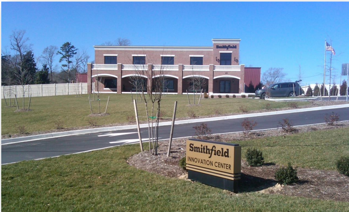
Smithfield Foods Innovation Center, Smithfield, Virginia

MAP has worked on diverse utility infrastructure projects that require various environmental clearances and permits. Since 2006, we have provided environmental consulting services to Smithfield Foods on matters relating to wetlands and water quality. We have provided wetlands identification, delineation, and Chesapeake Bay Preservation Area (CBPA) Services, and secured Federal and State approval for roadways, utilities and storm water improvements near the Pagan River. Recently, MAP was engaged in wetlands permitting and CBPA services for Smithfield's facilities.