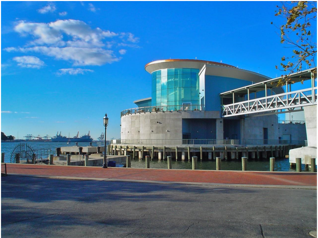
Norfolk Cruise Terminal, Norfolk, Virginia

MAP is routinely involved in the regulatory coordination and permitting for a variety of waterfront projects. Recently, MAP assisted the Department of Game and Inland Fisheries with the Federal and State permitting for the Princess Anne Wildlife Management Area boat launch facility.