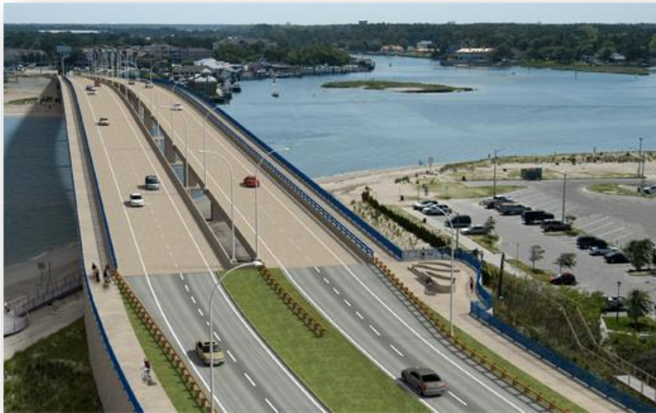
Lesner Bridge Replacement Project, Future Rendering

From bridge replacements to roads and tunnel expansions, MAP has garnered significant transportation experience. An example of our recent transportation work is the Lesner Bridge Replacement Project in Virginia Beach, Virginia. Following the completion of the Federal Highway Association (FHWA) and Virginia Department of Transportation (VDOT) approved Environmental Assessment in October 2009, MAP assisted in the procurement of the Finding of No Significant Impact (FONSI) in November 2011. MAP procured the Federal and State permits on this project in 2013. Construction began in spring 2014, and MAP is shepherding all federal and state compliance monitoring until project completion (scheduled for late 2018).