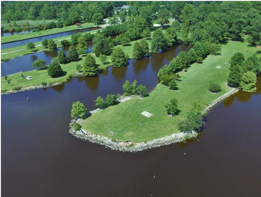
Munden Point Park Virginia Beach, Virginia

We offer our clients a variety of services and options. Examples of our services are listed below: