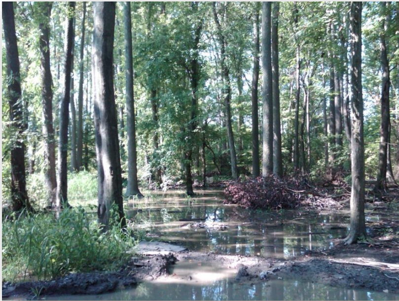
Burton Station, Virginia Beach, Virginia

MAP has also worked on various Land Development projects. We have worked with companies that are constructing homes, businesses that are looking to expand, and various government and city officials on public projects. One of our most recent projects regarding land development is the Burton Station Phase III Strategic Growth Area in Virginia Beach. Under the direction of Clark Nexsen, we are handling the environmental permitting responsibilities on the project.