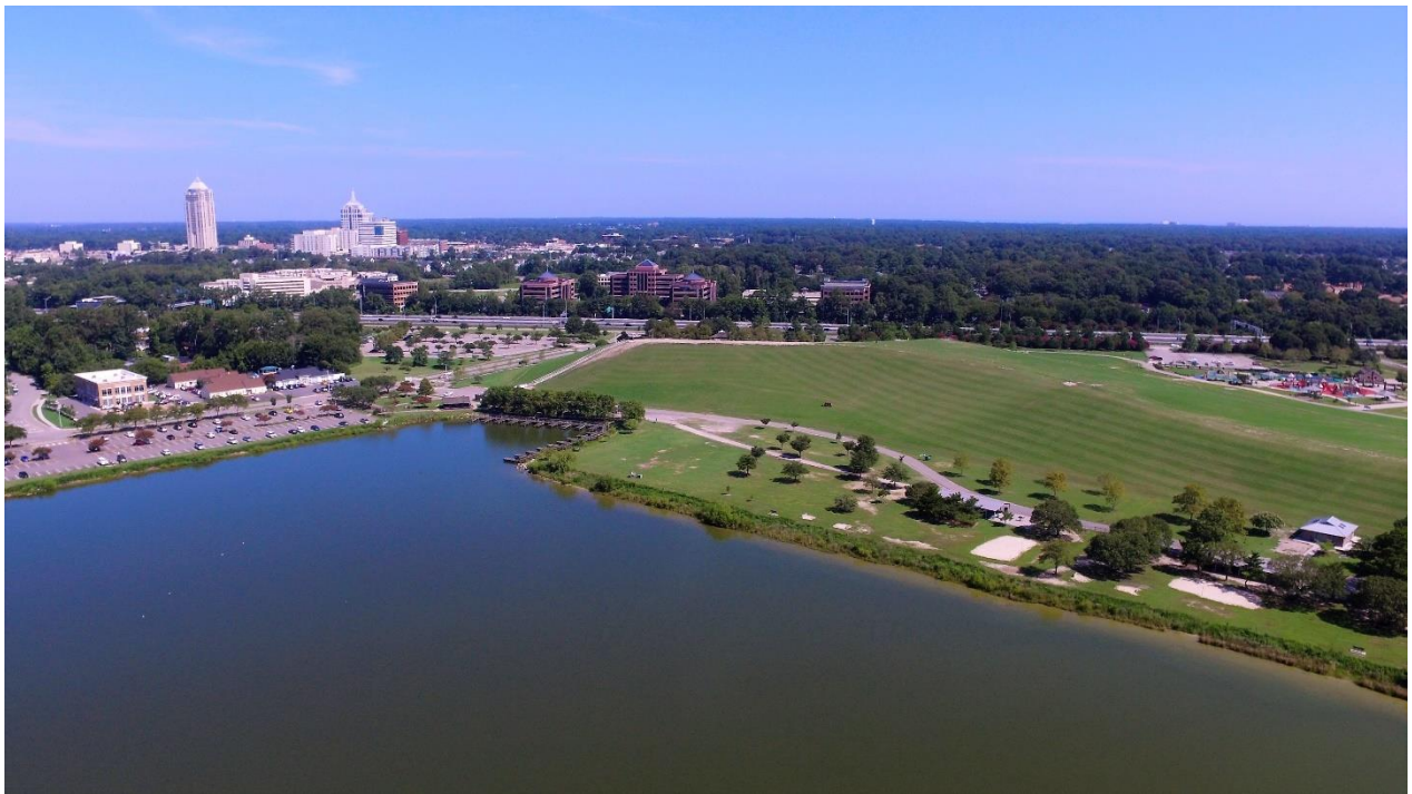
Mount Trashmore Park, Virginia Beach, Virginia

MAP also has significant experience with Parks and Recreation projects. One of our more notable projects is the Mount Trashmore Park, which is frequented by over one million visitors annually. Since 2000, MAP has performed wetland compliance studies at Lake Trashmore at the park. Currently, MAP provides environmental services for the City of Virginia Beach – Parks and Recreation Annual Services Contract with Clark Nexsen.