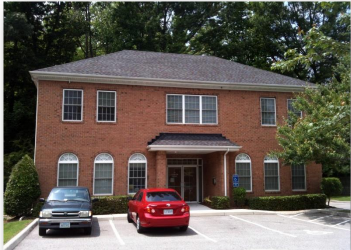
MAP Environmental Inc. Headquarters Virginia Beach, Virginia

As with any professional consulting company, our clientele is the lifeblood of our business. Our growing list of clients includes both public and private companies in the Hampton Roads area and other parts of Virginia.